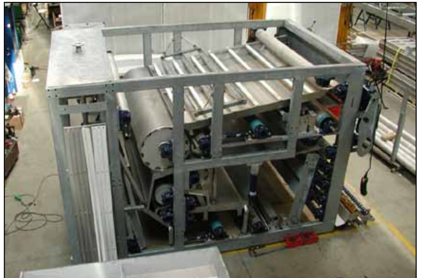
KD 10-2000 under production

By choosing Danish Wastewater Equipment A/S, you get a quality supplier!