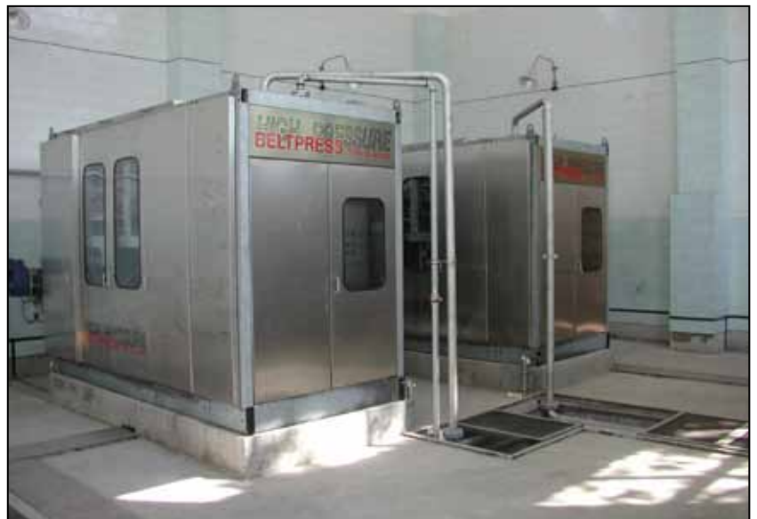
2 x KD 10-1500 - Brest WWTP